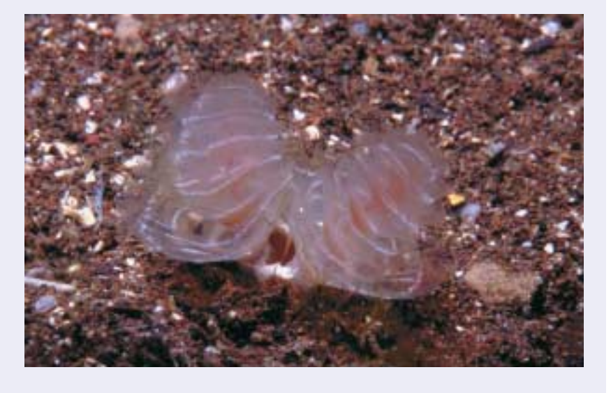
Photo: A golden phoronid ( Phoronopsis californica ) in Madeira (São Pedro, southeast coast, about 100 ft [30 m] depth) showing the helicoidal shape of the lophophore.

Sedentary, infaunal, benthic suspension-feeders with a vermiform (worm-like) body that bears a lophophore and is enclosed in a slender tube in which the animal moves freely and is anchored by an ampulla.