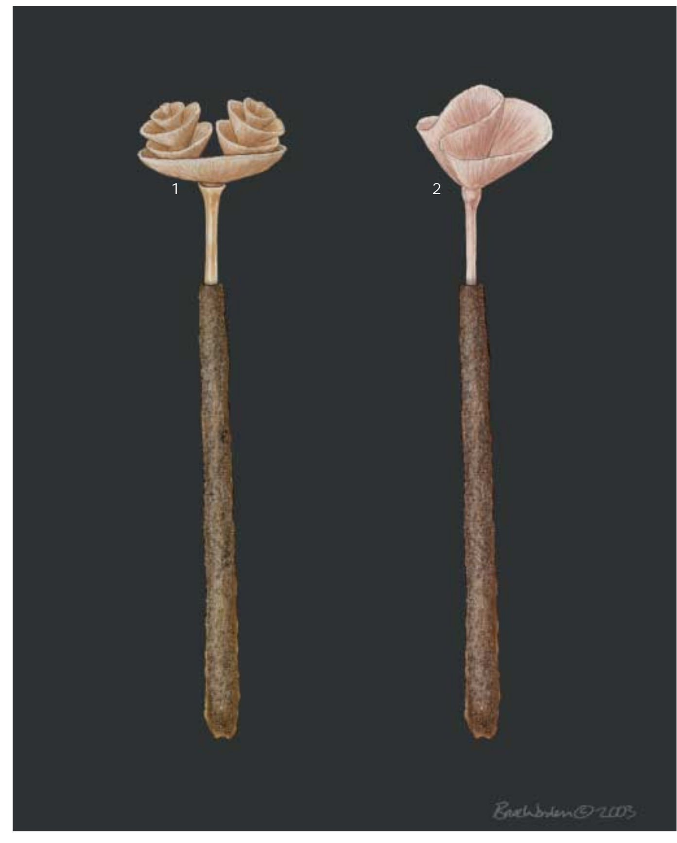
1. Phoronopsis harmeri; 2. Phoronis ijimai. (Illustration by Bruce Worden)