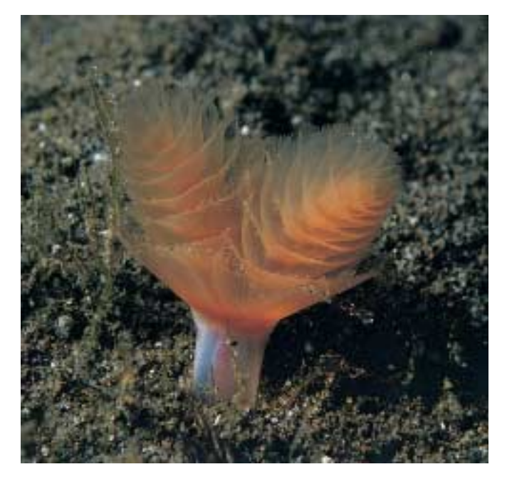
A phoronid worm ( Phoronopsis californica ).