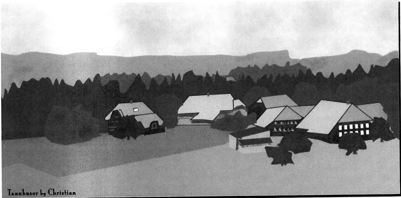
Tannhuser seen from the obere Steg (Schonegg) - beyond the forest a part of the roof of Schürchtanne is seen. The three farms are aligned.