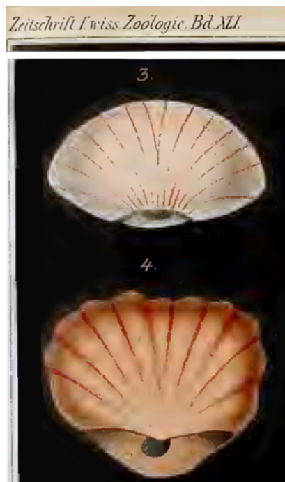
Fig. 1. Argiope cuneata (3), which size is 3 on 5 mm, and Argiope barroisi (4) from Table VIII (facsimile) of Schulgin (1885) (Villafranca, Sicily).

In a study just issued, Albano & Stockinger (2019) describe the distribution of Joania cordata and Argyrotheca cuneata (Fig. 2) in a Posidonia meadow at Plakias (Crete, Greece): the first species represents around 65% of living brachiopod individuals. Most living specimens were attached with their pedicle to any hard substrate available such as rhizome fragments, coralline algae, sessile foraminifera, bryozoan colonies, and empty gastropod shells. Previously occurrences in such Mediterranean meadows had already been reported, i.e., by Eugene (1978), Taddei Ruggiero (1985), Evangelisti et al. (2011, 2012, 2014) and of course by Schulgin (1885). All authors also mention the occurrence of some valves of Megathiris detruncata and Novocrania anomala .