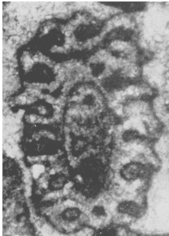
Figure 3: Holotype of Clypeina paucicalcareae (CONRAD, 1970) nov. comb. Oblique section through 6 verticils. Sample CONRAD 319, slide 6 (Upper Hauterivian, TST Ha5); Rocher-des-Hirondelles, La Rivière, Ain, France; M.A. CONRAD Collection, Muséum d'Histoire naturelle, Genève. Scale bar: 250µm [Some rights reserved].

Emended diagnosis: Clypeina representative with close set verticils consisting of 8 to 16 slightly phloiophorous laterals. Corresponding pores first gently inclined, then rapidly bending outward and almost horizontal distally. Biometric measurements (Table 1) might help discriminating this species from the other representatives of the genus.