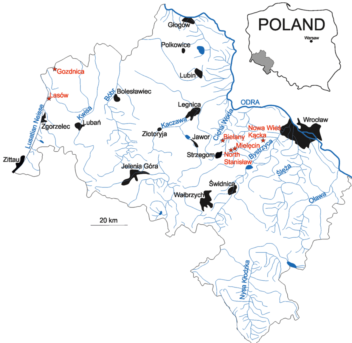
Figure 1: Schematic map of towns and modern river systems in SW Poland (modified after ADAMSKA, 2013; ADYŃKIEWICZ-PIRAGAS and LEJCUŚ, 2013) with respective location of moldavite-bearing pits (red stars).

worked and redeposited in the Miocene rivers (BOUŠKA, 1964, 1988; ŽEBERA, 1972; LANGE, 1996; BOUŠKA et al. , 1999; TRŃKA and HOUZAR, 2002; BUCHNER and SCHMIEDER, 2009). This explains why the age of moldavite-bearing deposits differs so drastically from the age of these tektites' formation. The preliminary results of the experimental tumbling of moldavites confirmed their high susceptibility to fluvial abrasion (BRACHANIEC, 2018). However, the generally accepted river-flow velocities in SW Poland and sedimentary deposition variability did not allow for the precise determination of the relationship between river flow velocity, sedimentary type, and distance of fluvial transport of tektites at hand (BRACHANIEC, 2018). An important factor determining the distance of glass transport in river environments seems to be the amount of gravel: in the case of moldavite-bearing sediments of SW Poland, the percentage