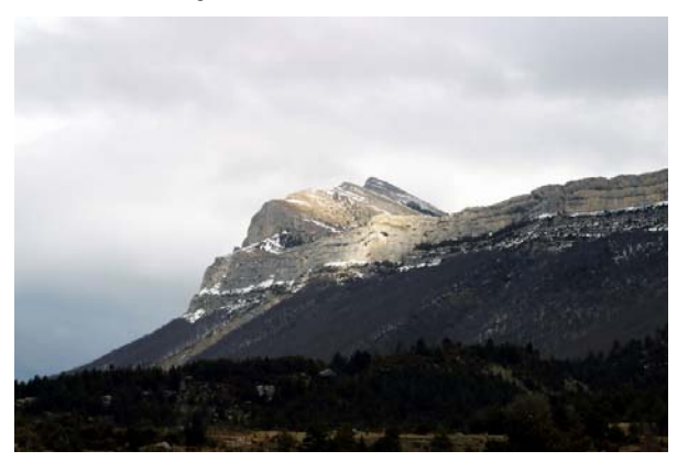
Figure 4: Pic de Couard with cliff and folds in the late Jurassic Tithonian stage limestones.

The Natural Geological Reserve of Haute-Provence, home to the GeoPark, was founded in 1984, pursuant to the 1976 Law on the protection of Nature to preserve palaeon-tological deposits from looting. The prime tool for such protection was, and remains, educating the public of the value of the geological and palaeontological heritage, rather than repressive measures, although strict enforcement of regulations remains an inevitable necessity.