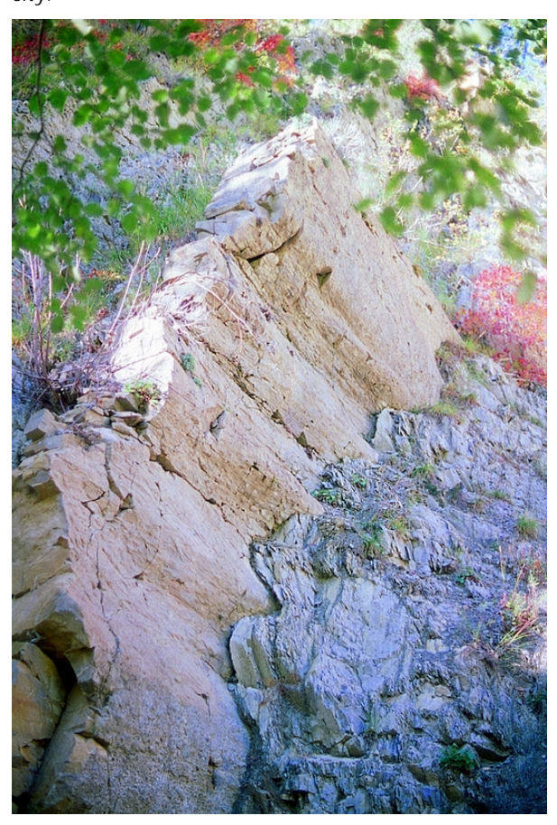
Figure 3: Upper Jurassic limestones shaped by underwater currents in the Bès valley, north of Digne les Bains.

The Mesozoic Era has abundant fossils, as does the Cainozoic, with a variety of deposits in less stable palaeogeographic settings. The most spectacular include sirenian bones (Eocene) (Fig. 8) and bird tracks (Miocene).