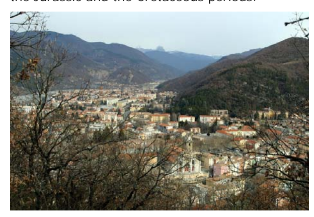
Figure 2: The city of Digne les Bains is the center of Haute-Provence GeoPark and the department capital. Fossiliferous rocks abound in the region around the city.

Carboniferous period. But most of the fossils are marine organisms dating from the Mesozoic. Ammonites -both Jurassic and Cretaceous- are particularly numerous: in addition to the famous Sinemurian ammonite slab in Digne (Fig. 6), Callovo-Oxfordian deposits and Lower Cretaceous strata contain abundant uncoiled ammonites, including the Barremian particular, whose stratotype is located in the heart of the Réserve Géologique. Besides the ammonites, the GeoPark is also famous for several ichthyosaur fossils (Fig. 7) from both the Jurassic and the Cretaceous periods.