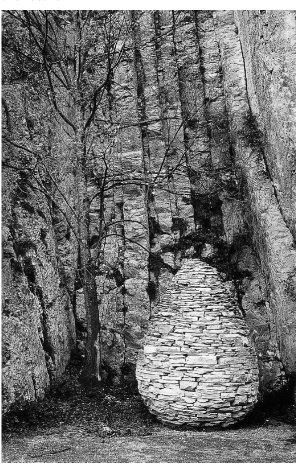
Figure 11: Andy GOLDSWORTHY'S Sentinel in Les Clues de Barles.

From the start, the Reserve, then the GeoPark of Haute-Provence has made remarkable headway in preserving the geological heritage in place and making it accessible to the public. In the early 1980s, the first site museum was dedicated to the Toarcian ichthyosaur of La Robine. Today, five major sites are maintained and physically preserved in place, from the skeletons of sirenians near Castellane to the bird tracks in the Bès Valley. This policy of preservation and display will be pursued in the future.