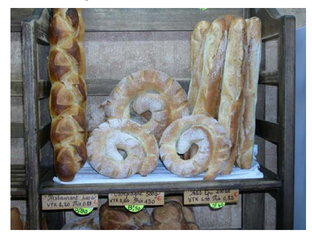
Figure 9: Ammonite bread, baked locally in the town of Barrême.

training adapted to the territory. Today over fifteen of them, approved by the Reserve according to their knowledge level, work with school children and visitors. Another type of action involves encouraging artists and craftsmen to seek inspiration in the geological heritage for their creations. For example, ammonites inspired a small number of partners in shaping bread (Fig. 9), chocolates and ceramics (Fig. 10).