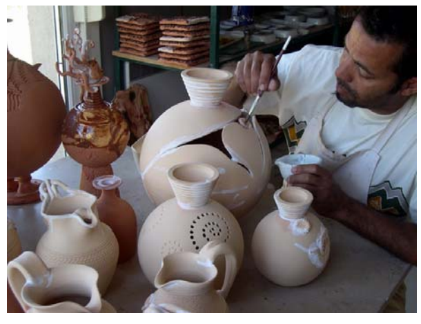
Figure 10: Ceramist working with ammonites forms.