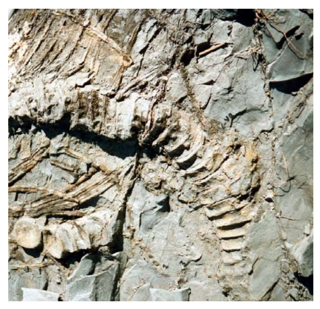
Figure 7: In the upper Bléone valley, an ichtyosaur from the upper Cretaceous is preserved and conserved in place. It is protected from man and climate by a wooden shelter.

Raising public awareness has taken two directions: addressing the territory's inhabitants with special emphasis on local schools and events in villages, on the one hand, and targeting visitors through discovery trails and museums, on the other. Raising awareness among the territory's inhabitants has led to