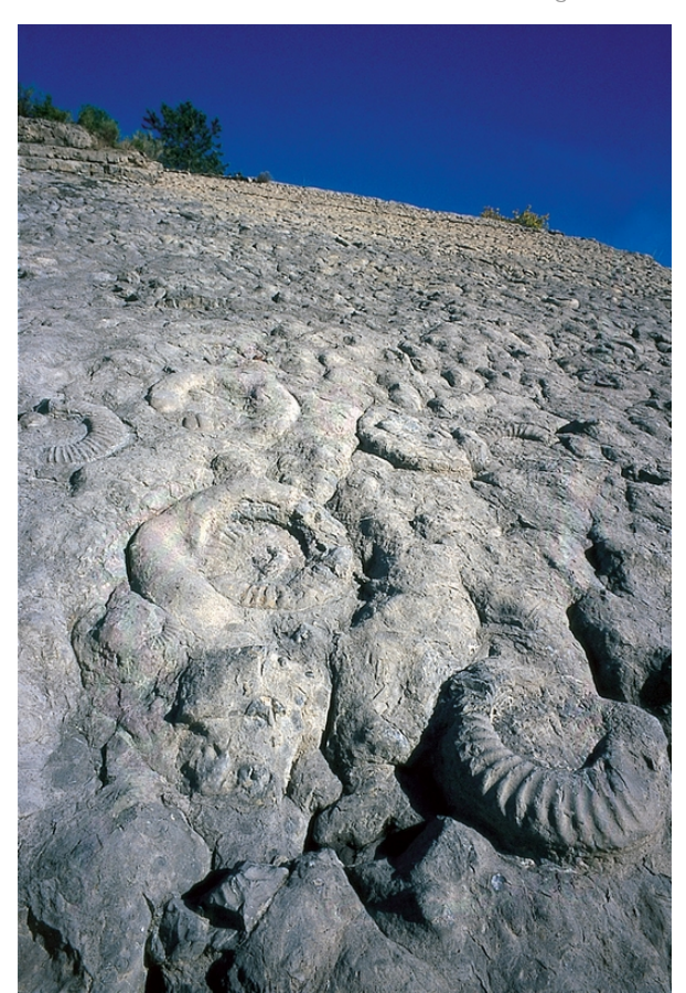
Figure 6: The ammonite slab at Digne les Bains, with more than 3500 exposed ammonites from the early Jurassic Sinemurian stage, is the most famous fossiliferous site in the GeoPark.