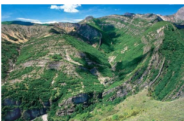
Figure 5: Vélodrome fold, near Barles, in Miocene marine and continental sediments.

At the start, only 18 rather limited sites were protected, but, over the years, pursuant to the Law, a peripheral zone was created, with less stringent constraints, but ensuring proper conservation of the geological heritage. Founded in 1989 with 36 communes around Digne-les-Bains, this protected area today covers 2,100 square kilometres and 55 communes in two départements (Alpes de Haute-Provence and Var). Overall, in this vast territory, no fossils may be collected. Only professionals and recognized amateurs may obtain special permits for scientific purposes.