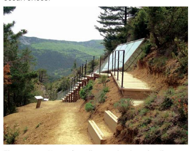
Figure 8: Near Castellane, sirenian fossils are protected beneath covered exhibits so they can be viewed by visitors.

By 1996, with support from the European Leader II programme, an action plan for the development of geotourism was started, in particular, the preparation in stages of three heritage trails: Hautes Vallées de l'Asse (Upper Valleys of the Asse River), Massif du Blayeul (Blayeul Massif), Route du Temps (Road of Time). In this context, many sites were developed into in-place museums, including sites revealing fossil sirenians, ichthyosaur, abundant ammonites preserved on a single slab of rock, bird tracks, and other interesting occurrences.