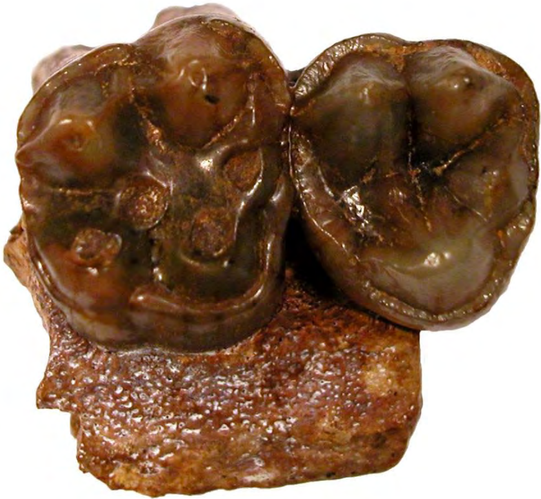
Figure 15: NMB T.S.631: Holotype of Hallensia parisiensis FRANZEN, 1990. Scale bar: 10 mm.