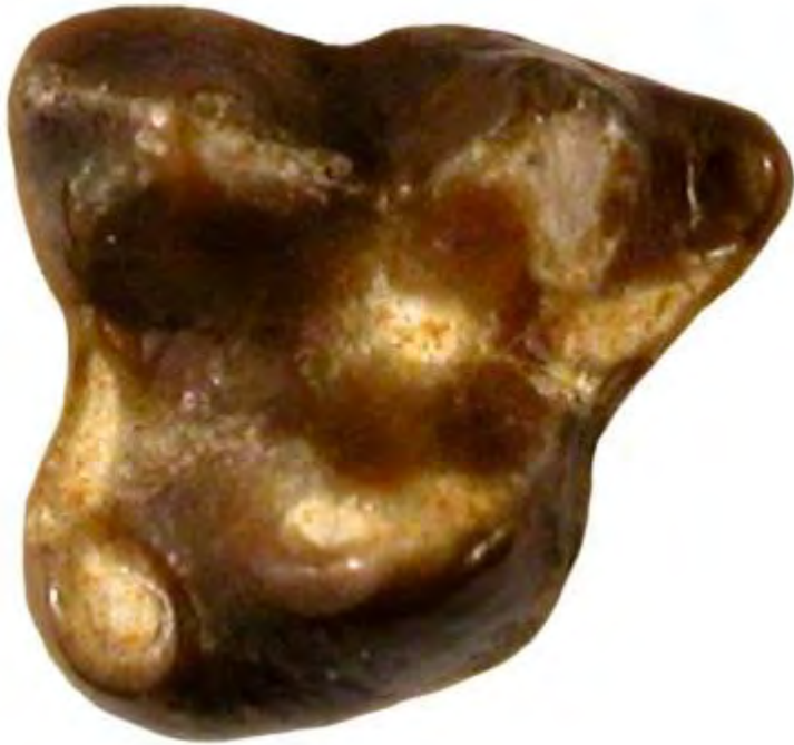
Figure 1: NMB Ef.990: Holotype of Phenacodus minor RÜTIMEYER, 1891, now known as Heterohyus europaeus (RÜTIMEYER, 1891). Scale bar: 10 mm.