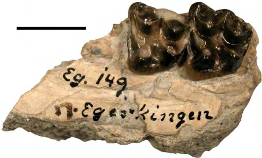
Figure 12: NMB Eg.149: One of the syntypes of Catodontherium fallax STEHLIN, 1910. Scale bar: 10 mm.