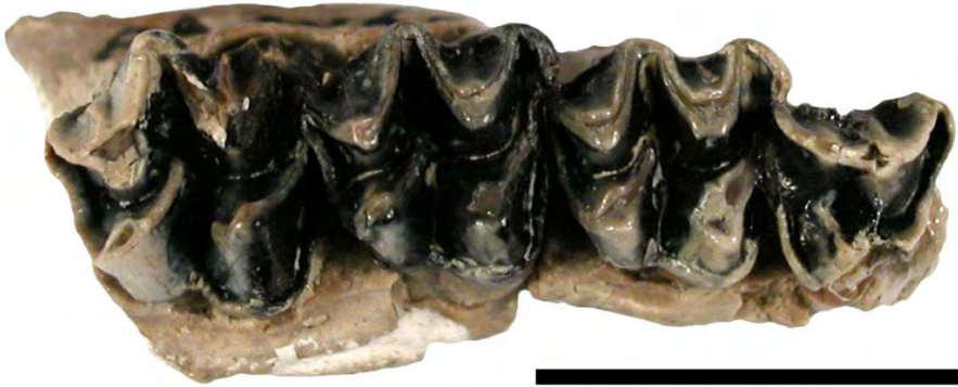
Figure 13: NMB Eg.228: Holotype of Dichodon simplex KOWALEVSKY, 1873. Scale bar: 10 mm.