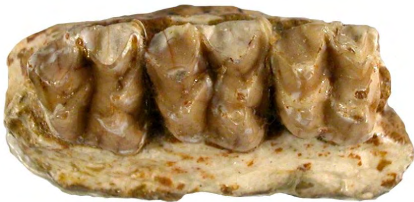
Figure 14: NMB Ef.120: Holotype of Leptotheridium traguloides STEHLIN, 1910. Scale bar: 10 mm.

STEHLIN H.G. (1910).- Die Säugetiere des schweizerischen Eocaens, Sechster Teil: Catodontherium - Dacrytherium - Leptotheridium - Anoplotherium - Diplobune - Xiphodon - Pseudamphimeryx - Amphimeryx - Dichodon - Haplomeryx - Tapirulus - Gelocus - div. Nachträge.- Abhandlungen der Schweizerischen Palaeontologischen Gesellschaft , vol. 36, p. 838-1164.