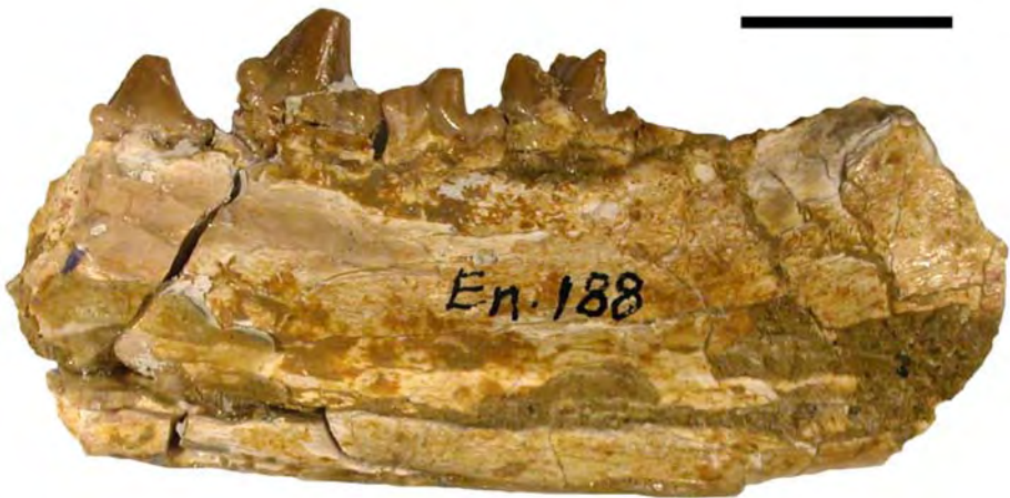
Figure 3: NMB En.188: Lectotype of Pseudosinopa ruetimeyeri DÉPÉRET, 1917, now known as Cynohyaenodon ruetimeyeri (DÉPÉRET, 1917). Scale bar: 10 mm.