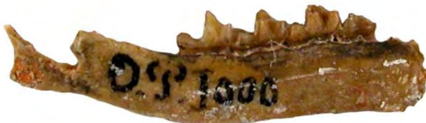
Figure 7: NMB Q.P.1000: Part of holotype (skull not figured) of Paraphyllophora robusta REVILLIOD, 1922, now known as Paraphyllophora quercyi REVILLIOD, 1922. Scale bar: 10 mm.