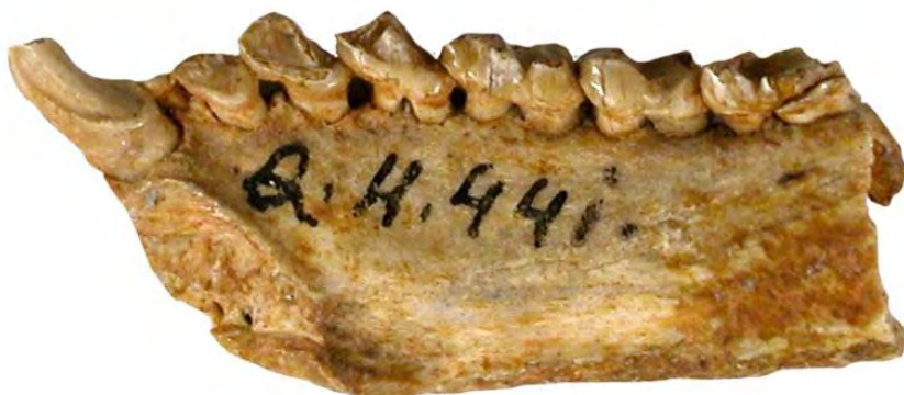
Figure 9: NMB Q.H.441: One of the syntypes of Necrolemur antiquus major STEHLIN, 1916. Scale bar: 10 mm.

Valid name: Necrolemur antiquus major STEHLIN, 1916