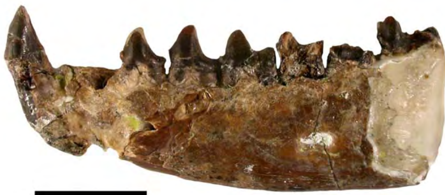
Figure 2: NMB Bchs.100: Holotype of Buxolestes hammeli JAEGER, 1970. Scale bar: 10 mm.