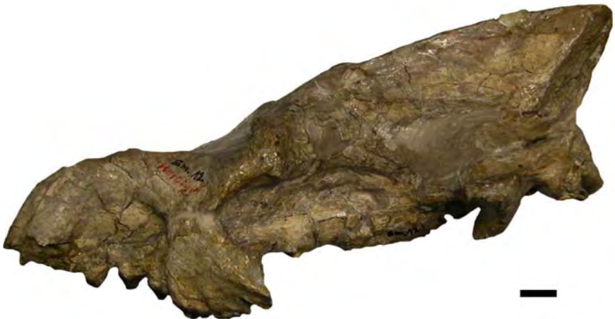
Figure 4: NMB Em.12: Holotype of Prodissopsalis theriodis van VALEN, 1965 now known as Eurotherium theriodis (van VALEN, 1965). Scale bar: 10 mm.