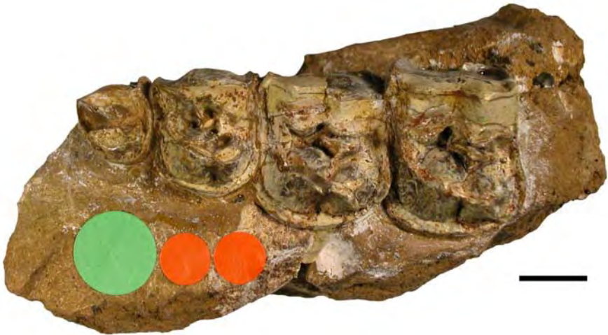
Figure 16: NMB Ec.403: Lectotype of Palaeotherium castrense NOULET, 1863. Scale bar: 10 mm.

NOULET J.-B. (1863).- Étude sur les fossiles du terrain Éocène supérieur du bassin de l'Agout (Tarn).- Mémoires de l'Académie Impériale des Sciences, Inscriptions, et Belles-Lettres de Toulouse , vol. 6, n° 1, p. 181-206.