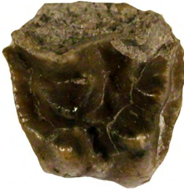
Figure 11: NMB Eg.514: Holotype of Phenacodus europaeus (RÜTIMEYER, 1888) now known as Meniscodon europaeum (RÜTIMEYER, 1888). Scale bar: 10 mm.