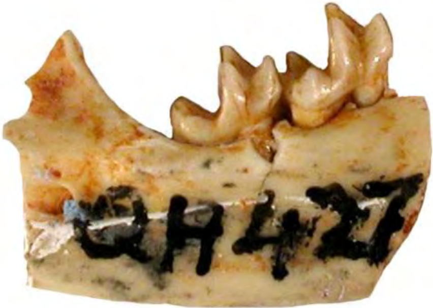
Figure 6: NMB Q.H.427: Holotype of Necromantis grandis REVILLIOD, 1920, now known as Necromantis adichaster WEITHOFER, 1887. Scale bar: 10 mm.

REVILLIOD P. (1920).- Contribution à l'étude des Chiroptères des terrains tertiaires (2ème partie).- Mémoires de la Société Paléontologique Suisse , vol. 44, p. 61-130.