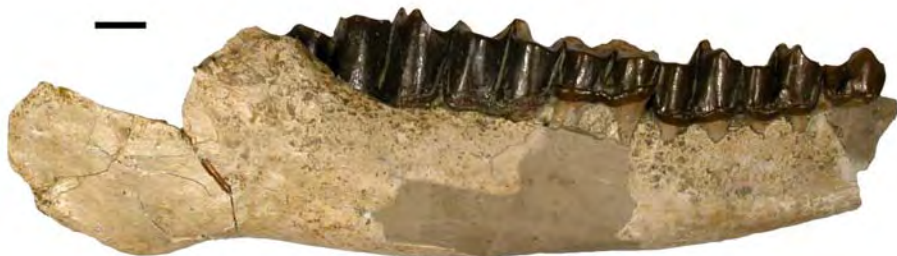
Figure 17: NMB Cst.157: Holotype of Palaeotherium pomeli FRANZEN, 1968. Scale bar: 10 mm.

FRANZEN J.L. (1968).- Revision der Gattung Palaeotherium CUVIER 1804 (Palaeotheriidae, Perissodactyla, Mammalia).- PhD Thesis, Naturwissenschaftlich-mathematische Fakultät der Albert-Ludwigs-Universität zu Freiburg, 181 p.