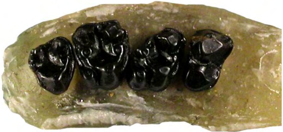
Figure 5: NMB Bchs.560e: Part of holotype of Alsaticopithecus leemanni (HÜRZELER, 1947) now known as Amphilemur leemanni (HÜRZELER, 1947). Scale bar: 10 mm.

Bchs.560e Upper right P1-M3 Bchs.560b Upper P4 Bchs.560c Upper right I Bchs.560d Upper C Bchs.560e Upper P4-M3 Bchs.560f Upper right M2-M3 Bchs.560g Lower left p4-m3 Bchs.560h Lower right m1-m3 Bchs.560i Upper P3 Bchs.560j Lower p3 Bchs.560k Lower p1