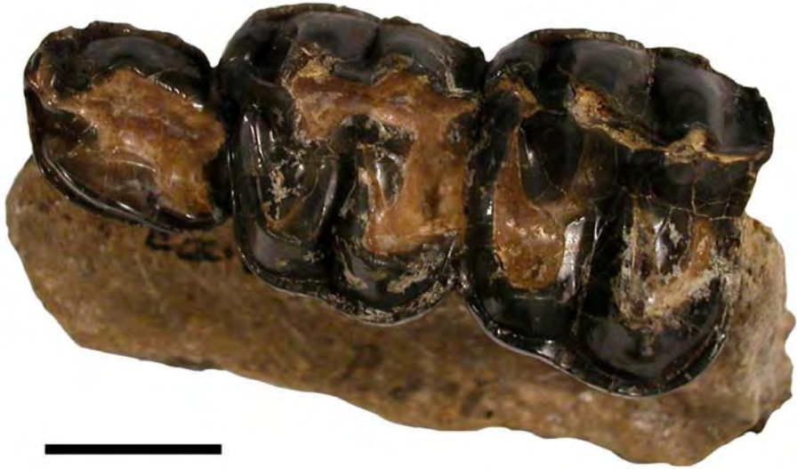
Figure 18: NMB Ea.5: Lectotype of Lophiodon annectens RÜTIMEYER, 1891, now known as Chasmothorium cartieri (RÜTIMEYER, 1862). Scale bar: 10 mm.