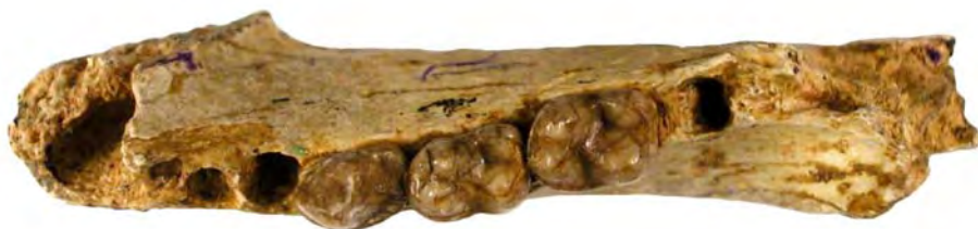
Figure 8: NMB Q.V.619: Holotype of Protadapis brachyrhynchus (STEHLIN, 1912) now known as Cercamonius brachyrhynchus (STEHLIN, 1912). Scale bar: 10 mm.

Q.V.619 Fragment of left mandible with p4-m2